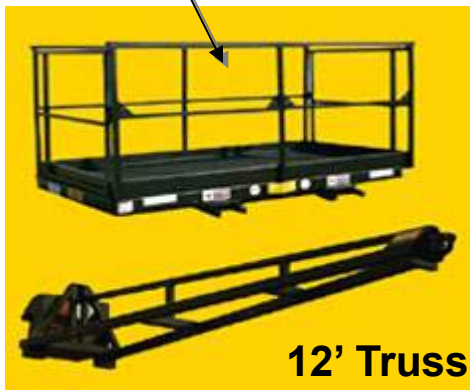
12' Truss Boom